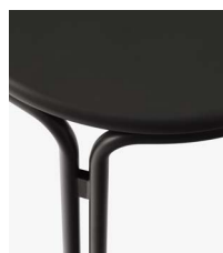
→ Warm Black