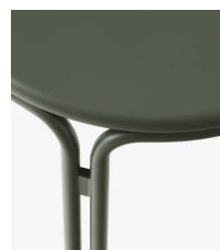
→ Bronze Green