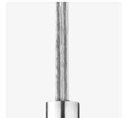
Silver luster glass and clear PVC cord