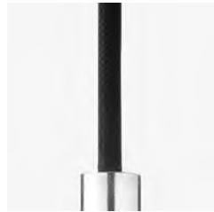
Clear glass and black fabric cord