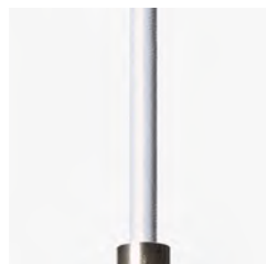
Gold luster glass and white fabric cord