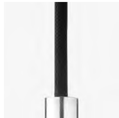
Silver luster glass and black fabric cord